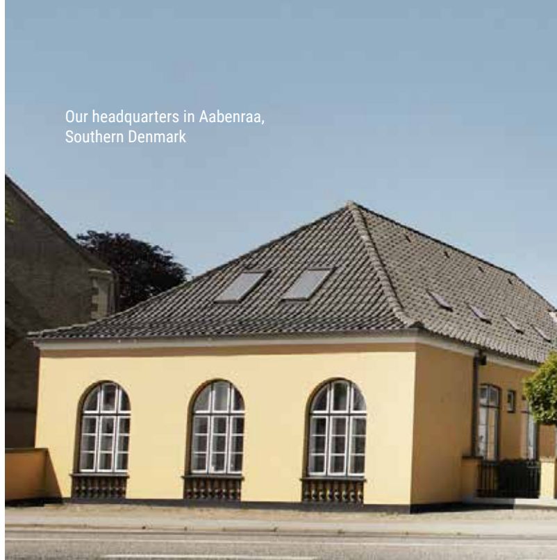
Our headquarters in Aabenraa, Southern Denmark

Our aim is to make a large and innovative contribution to a more sustainable future with much less impact on the climate and more responsible use of the earth's resources. As this is our core belief and focus, we can recycle what others will not touch and generate good business for you at the same time.